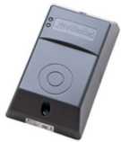
Prox Tag Reader